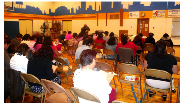
Recent casual Latino service with more than eighty in worship.

Financial for Lutherans up to $6000. Donations received at the service and through door offerings by November 15th will qualify. LMM is praying for a generous response.