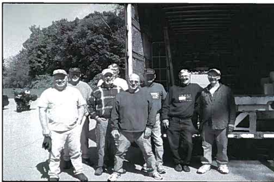
LWR work crew – volunteers from Calvary, St. John, and St. Paul.

“The rest of the trailer is filled by Church World Service, the partner sponsor for this project. It is then driven to the LWR warehouse in New Windsor, Maryland for distribution throughout the world.”