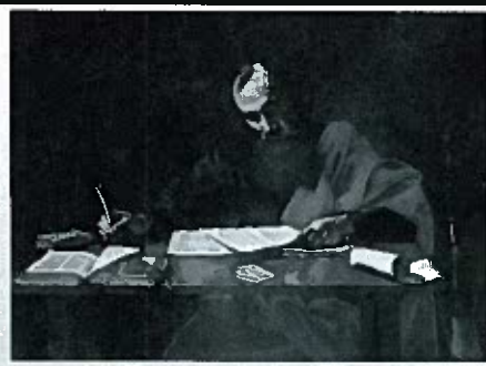
St. Paul writing his letters

The first celebration opportunity is our LMM sponsored Mission Festival on Sunday, October 5, noon to 2 p.m., at Calvary Lutheran Church. Many fellow Lutherans will be present to share how they are reaching out