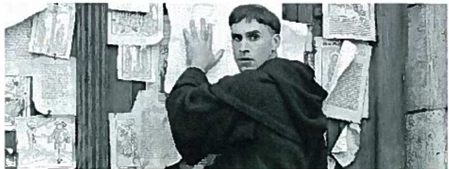
Nailing the 95 Theses, from the movie "Luther"

A time of fellowship will follow the service with light refreshment provided by Lutheran Multicultural Mission. Visitors also may wish to explore Holy Cross as they expand their facility to develop their Lutheran school.